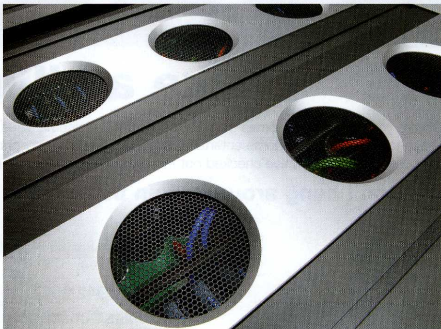
RIGHT: The massive aluminium top plate of the Titan amplifier section is ported to aid cooling. We would have shown you more of the case but it was just too big to fit on the page...

There was one immediate gripe, and that was the mechanical noise encountered. Those huge transformers got very upset with my mucky mains and, at peak neighbourhood demand, the power supply