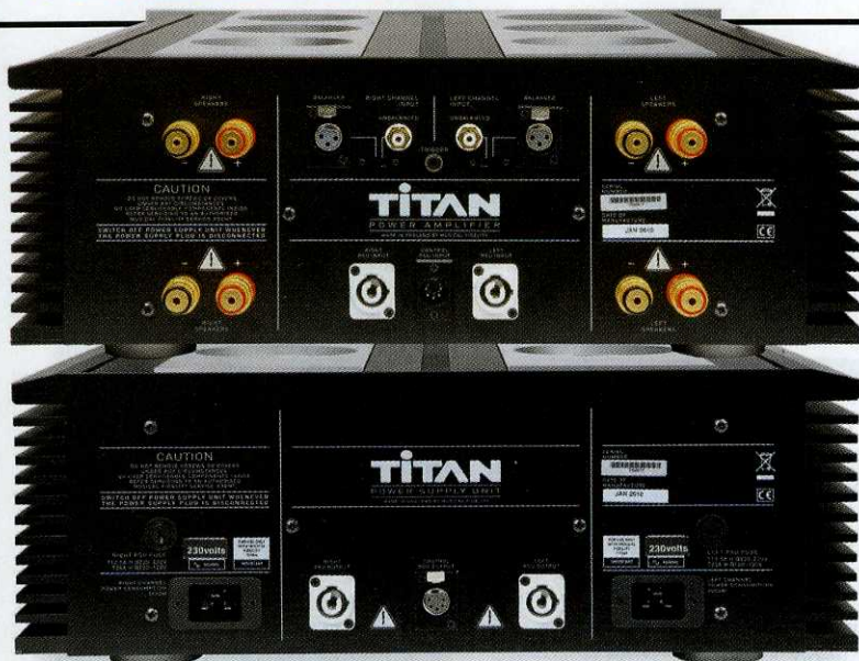
ABOVE: The Titan power supply (bottom) has twin 15amp power inputs and connects to the amplifier via dedicated Neutrik leads. The amplifier section (top) has balanced XLR and RCA inputs and pylon-sized locking speaker terminals

disc's charms and top-end dynamic are so well presented by the Titan I found myself scheduling vinyl evenings into the diary before the amp's inevitable return to MF.