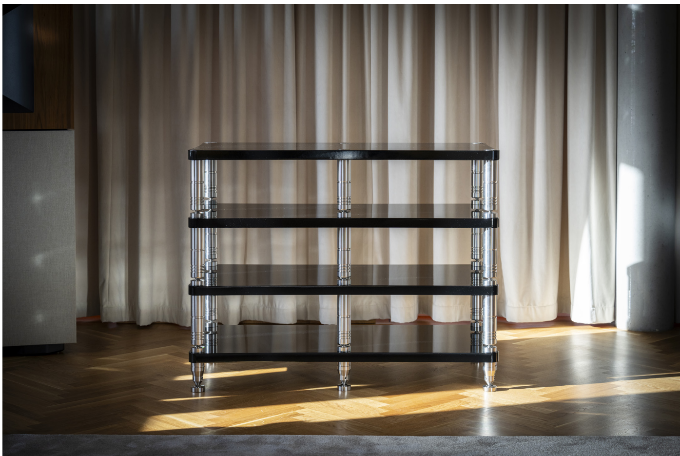
Nu-Vista Ultra Equipment Rack