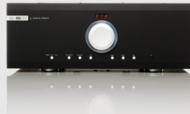
M6500i | DUAL MONO INTEGRATED AMPLIFIER

The M6i has the power and technical sophistication to drive any speaker with ease, sounding calm and unruffled as it moves from quiet musical moments to huge dynamic shifts.