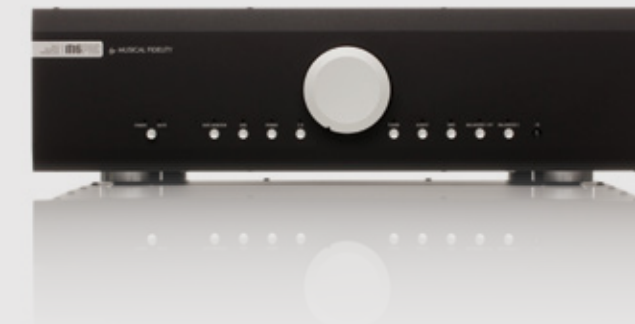
M6PRE | PRE-AMPLIFIER

From its technical measurements to its jaw-dropping sound, the M6 500i acts like an amp costing many times the money.