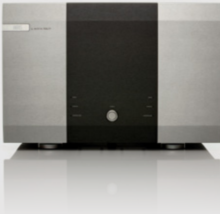
AMS50 | CLASS A POWER AMPLIFIER

The Primo is a truly extraordinary pre-amp - if you want to recapture the magic of music, it has to be heard.