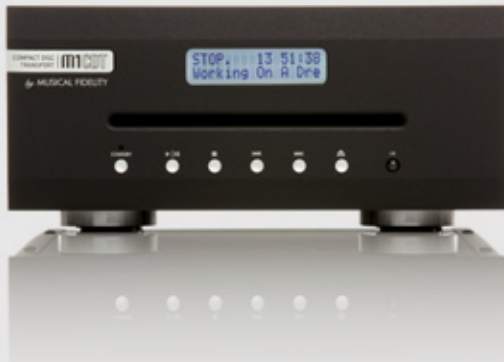
M1CDT | COMPACT DISC TRANSPORT

The M1 CLiC's exceptional capabilities may mean it's a hard product to categorise, but they make it easy to praise. EISA - Europe's most prestigious technology association – named the M1 CLiC as Best Network Player in its 2011-2012 Awards; Gramophone's review called it "remarkable for the money", Hi-Fi News dubbed it "outstanding" and Hi-Fi World declared 'it's hard to think of another product that's as versatile'.