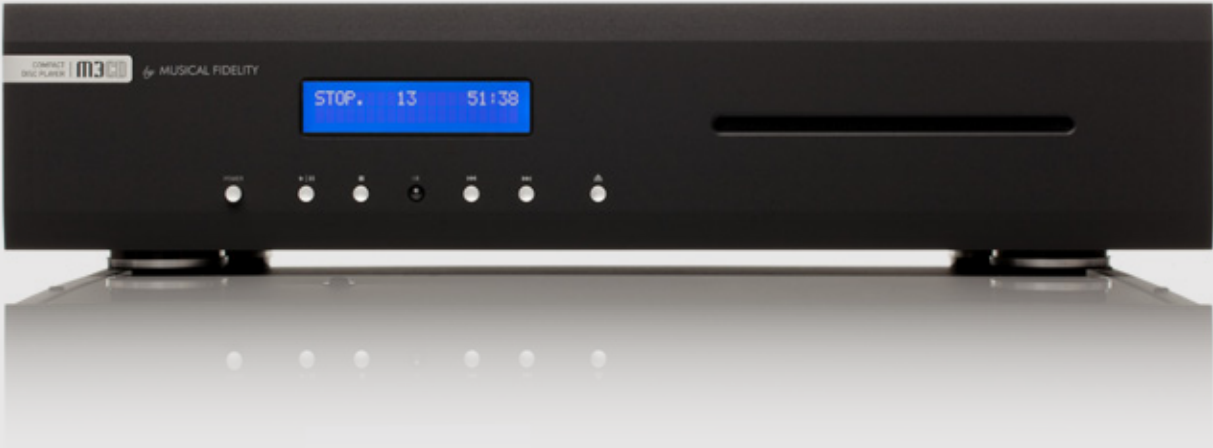
M3CD | CD PLAYER

Like the matching M3i integrated amplifier, the M3CD CD player is designed as serious Hi-Fi available at a modest price. From the fine fit and finish of its metal casework to the unique technology sitting inside, the M3CD exceeds expectations.