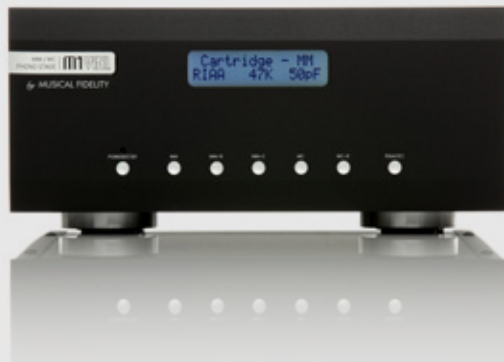
M1ViNL | PHONO STAGE

The M1 DAC has been met with incredible acclaim. Stereophile's review said it "offers performance that is close to the state of the art", calling it "a piece of kit that can transform your system " and "a stunning bargain".