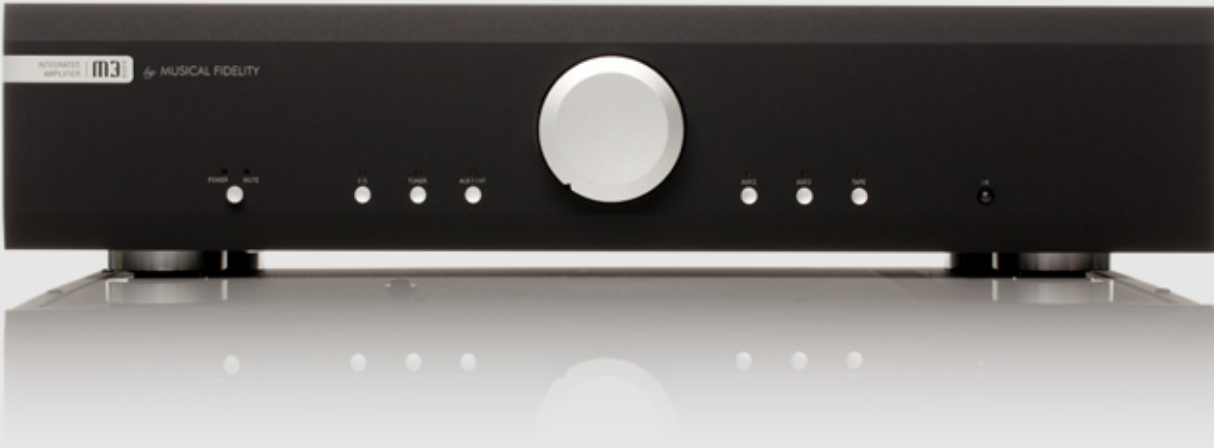
M3i | INTEGRATED AMPLIFIER

We say it's a great-looking, superb-sounding player you have to see and hear.