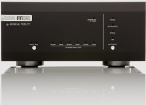
M1DAC | UPSAMPLING D/A CONVERTER

For sound and styling, the slot-loading M1 CDT is the perfect partner for the M1 CLiC or M1 DAC. The resultant compact pairing will take up the same space as a conventional-sized CD player and yet deliver so much more in terms of flexibility and performance.