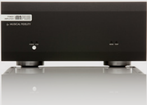
M1PWR | POWER AMPLIFIER

The M1 HPAP has already received much acclaim: the Hi-Fi Choice review stated "you might have to pay five times the HPA's asking price to significantly better its performance", while the Hi-Fi News group test concluded: "on excellent sound, facilities and value for money, the M1 HPAP is a clear winner."