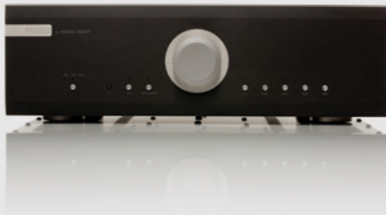
PRIMO | PRIMO PREAMP

This pure Class A design is essentially a discrete pre-amp neatly paired with dual-mono power amps within one box. It uses trickle-down technology from our flagship TITAN amplifier, sharing that powerhouse's characteristics in terms of low distortion, minimal noise, wide bandwidth and excellent load-driving ability. The latter means that despite its relatively modest 35 Watts-per-channel output, the AMS35i will effortlessly power all but the most demanding of speakers and fill all but the largest of rooms.