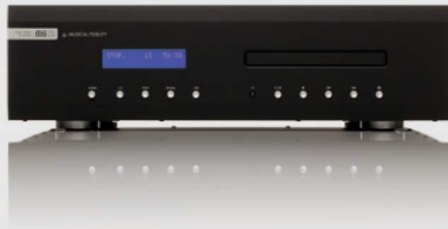
M6CD | 24 BIT 192KHz CD PLAYER

So much more than a mere CD player, the M6CD is a hub for all your digital entertainment – and the perfect source for the rest of the M6 range.