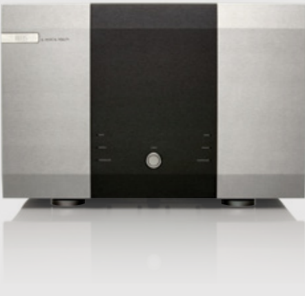
AMS100 | CLASS A POWER AMPLIFIER