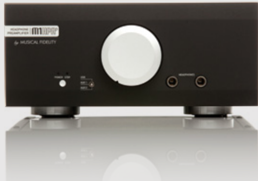
M1HPAP | HEADPHONE AMPLIFIERS

The M1 ViNL even allows you to switch resistance, capacitance or equalisation curve while you're playing records – so you can instantly hear the effect of each mode and more easily find the optimum settings for different cartridges and discs. A clear display and intuitive controls make the process simpler still.