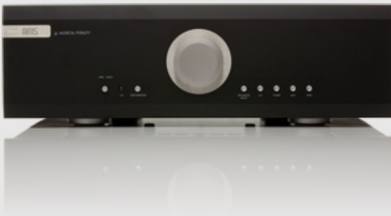
AMS35i | DUAL MONO INTEGRATED AMPLIFIER

All this plus the premium build quality and fabulous finish found across the entire AMS range. The AMS CD is a reference source you'll be proud to own and love to listen to.