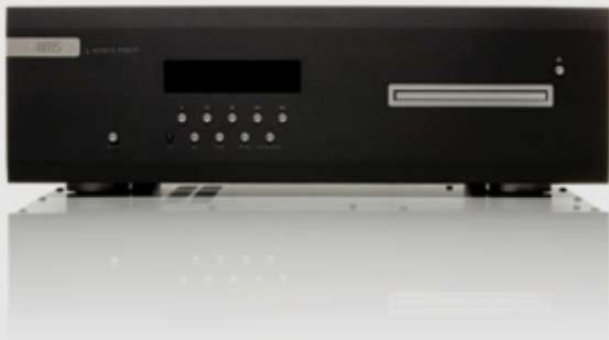
AMSCD | REFERENCE CD PLAYER

Quite simply, the AMS CD is the finest digital product we've ever made. It combines reference-standard CD playback with a multi-input DAC; it's the true Hi-Fi heart of a modern music system.