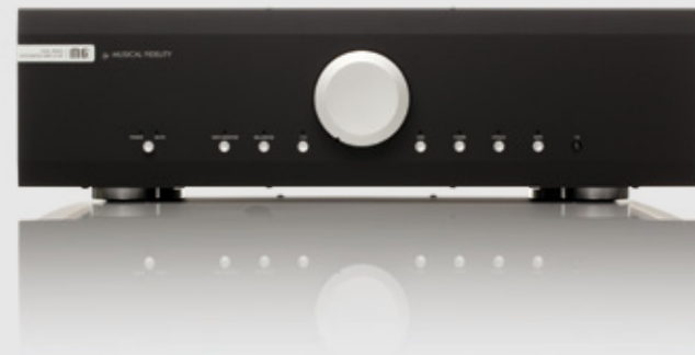
M6i | DUO MONO INTEGRATED AMPLIFIER