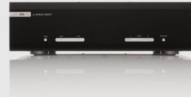
M6PRX | POWER AMPLIFIER