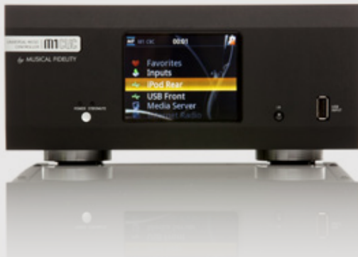
M1CLiC | UNIVERSAL MUSIC CONTROLLER

We describe the M1 CLiC as a universal music controller for all your digital and analogue sources.